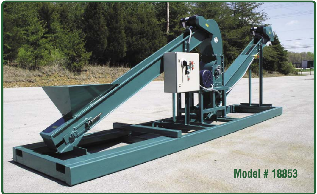
Model # 18853

Toll Free: (800) 443-6398 Phone: (931) 815-8520 Fax: (931) 815-2741 www.bouldincorp.com E-mail: info@bouldincorp.com